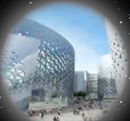
HOME & BUILDING AUTOMATION